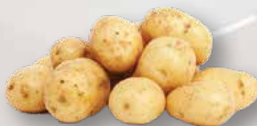
UK New Potatoes