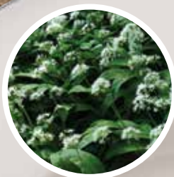
UK Wild Garlic