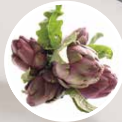
French Baby Artichoke