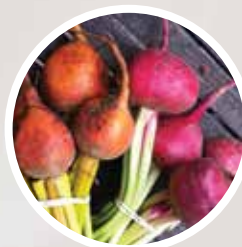
French Bunch Beetroot