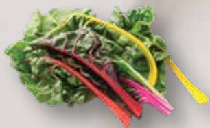
UK Rainbow Chard