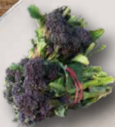
Purple Sprouting Broccoli