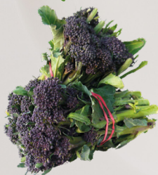
Purple Sprouting Broccoli